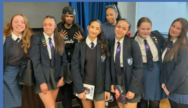
Year 10 students during a meet and greet session with the rap artists.