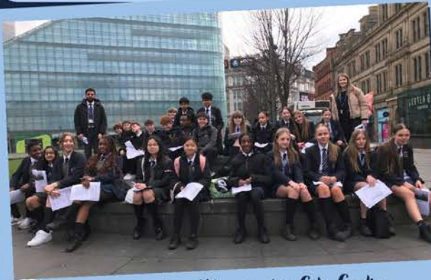
A group shot in Manchester City Centre, outside the Football Museum.

We recently took all of Year 8 into Manchester on a Humanities Field trip spanning over 3 days. Everyone took part in a History Scavenger Hunt, Geography Data Collection and also visited various Religious sights, including the Cathedral, St Ann's Church and the Cross Street Unitarian Chapel. Well done to everyone for their wonderful behaviour throughout the week and for all of the walking we did too!