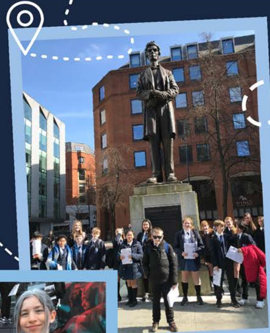
Students stumbled across a statue of Abraham Lincoln.