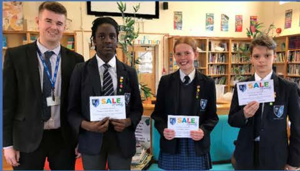
Well done students on collecting your Sale Award certificates! A great end to the term.