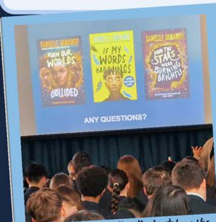
A talk from Danielle, all about how she became a best selling author.

Well done to our Key Stage 3 students that dressed up for World Book Day, what a wonderful effort and also during our school book sale week! We have been very busy in our school library!