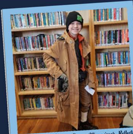
Our Student WBD overall competition winner. Reflecting the student's book character to the last detail.