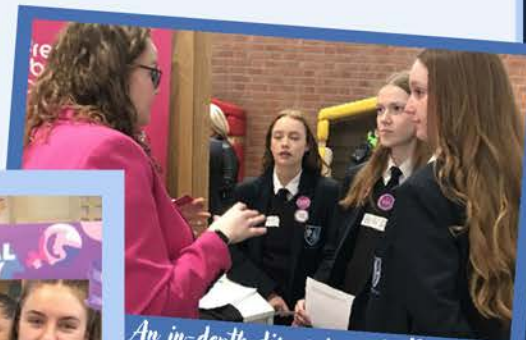
An in-depth discussion with Prevent Breast Cancer charity.