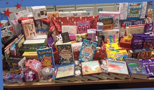
A very wonderful donation display!