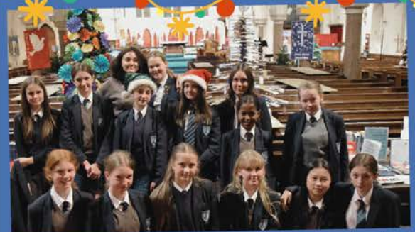
Our Eco and Unity club at St Paul's Parish Church in Sale.