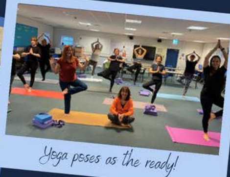
Yoga poses as the ready!