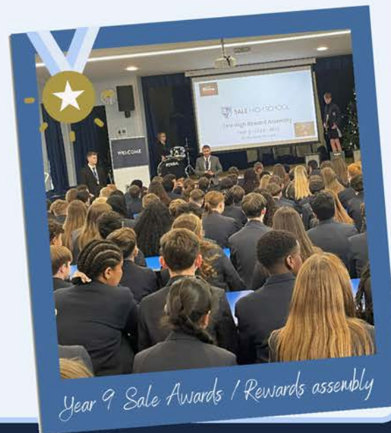
Year 9 Sale Awards / Rewards assembly