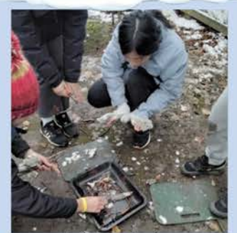
Fire lighting techniques