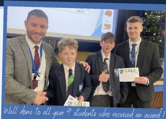
Well done to all year 9 students who received an award!

Well done to everyone. Keep up the good work in 2025!