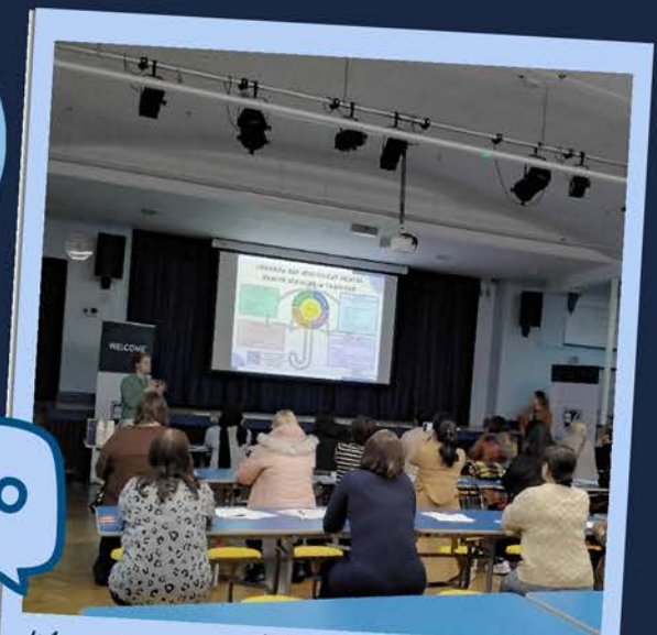
Managing your child's anxiety workshop