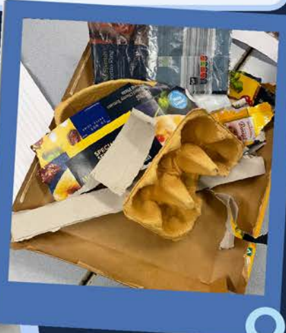
Examples of the settlement project created by Year 7.