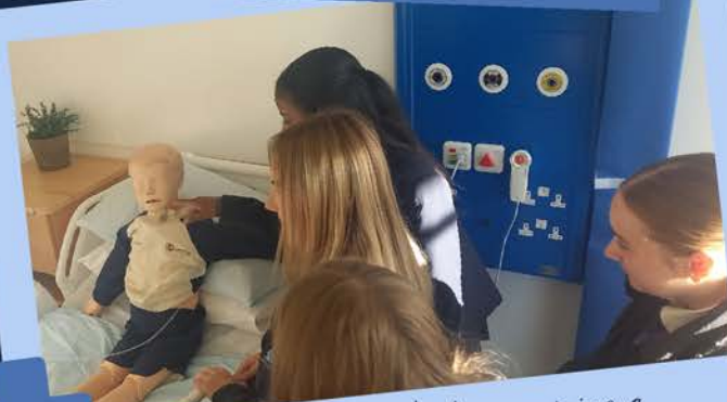
Sale High students examining a dummy for medical issues.

Our Year 7 residential got off to a very snowy start in Castleton! Students enjoyed lots of outdoor activities including, orienteering, fire lighting, making egg rockets and of course the odd obligatory snowball fight! We had two groups attending over different days and everyone had a wonderful time and represented our school so well!