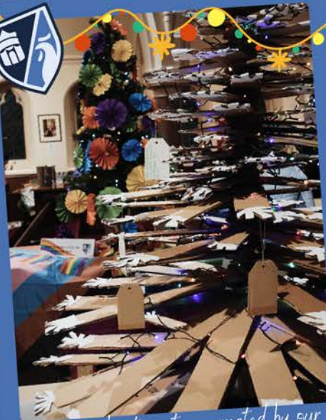
Fantastic Christmas trees created by our Eco Club and Unity Club!

Our wonderful Year 8 students have been busy making and decorating our three Sale High Christmas Trees at St Paul's Parish Church in Sale to celebrate their Christmas Tree Festival. A superb effort from all our Eco Club and Unity Club students that have worked so hard during their school breaks and lunches to make the decorations. Well done! We hope some of you managed to visit the church to have a look!