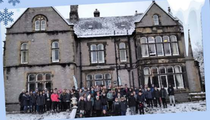
Castleton Trip 2024