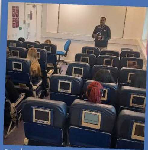
Students exploring careers in aviation!

We recently took some of our Year 10 Health and Social Care students to a world skills career event at Trafford College. Everyone enjoyed the activities and learning about future careers! Well done for representing our school so well!